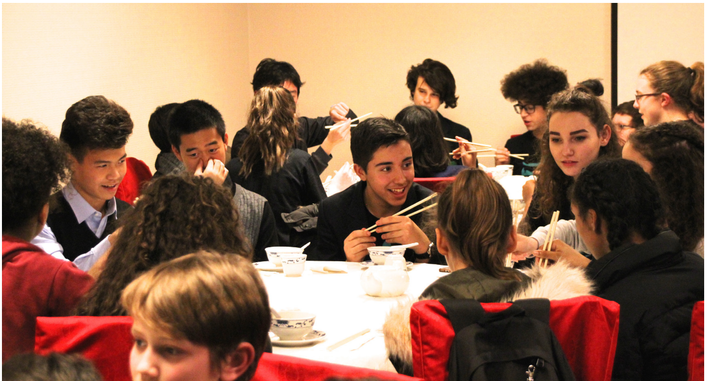
One Hundred and Twenty for Dinner in Chinatown

That said, ushering one hundred and twenty wired students, teachers, instruments onto two huge coaches parked in Shaftsbury Avenue during the rush hour, was a challenge. We counted them on, we counted them off. Seeing everyone back in school for an early start the following morning, was a testimony to the professionalism and leadership of the teachers in the Expressive Arts Faculty who planned and organised every step of the event.