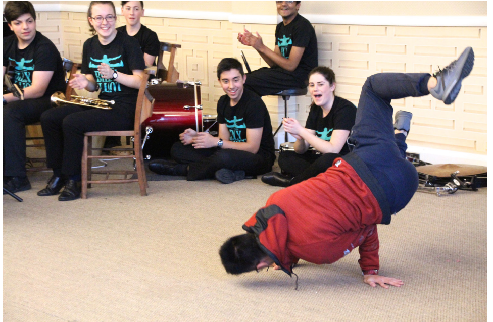
Chinese Break Dancing

It was an exhausting day. Five doors down and five hours later, dinner at a local Chinese restaurant was the perfect setting to round off a perfect day. One hundred and twenty students, teachers and parents enjoyed dinner together in the large, traditionally decorated Cantonese dining room. They enjoyed old-style dim sum, steamed pork ribs, rice rolls, prawn rolls and a variety of carefully pre-chosen dishes from a menu that could have stretched to China and back.