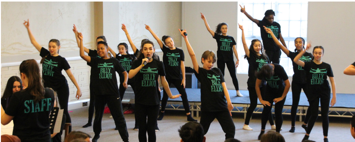
'Born to Boogie'

'Can there be anything more convincing of the depth and power of our partnership than what we have seen today. Students from opposite ends of the earth giving their all to welcome, embrace and cherish each other's lives, worlds, hopes and dreams. In an increasingly smaller and divided world, a world where politicians and diplomats struggle to find solutions, this exchange is bringing the world that much closer together, and lifelong friendships are being made.'