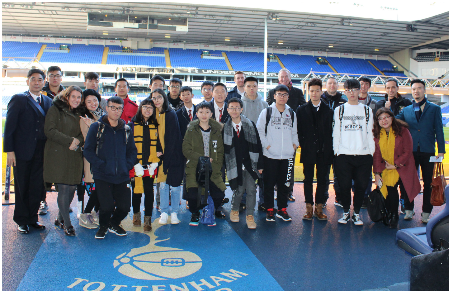
Team Shunde at Tottenham Hotspur

The students heard about the history of the club, its status and success in the Premier League. They asked questions