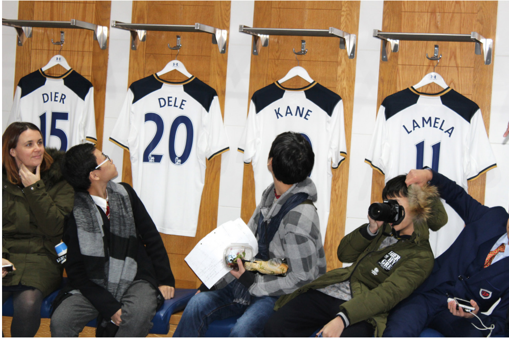
Tottenham Hotspur Changing Room