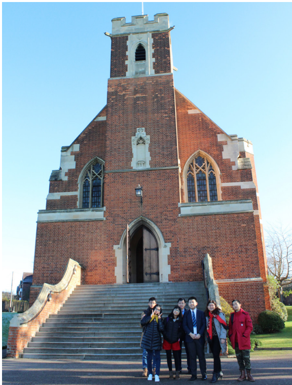
Visiting Bedford School